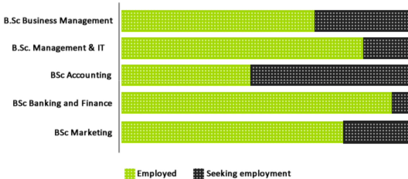
Graduate Employment by Programme